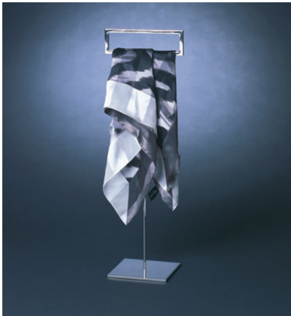
SINGLE SCARF HOLDER S-3