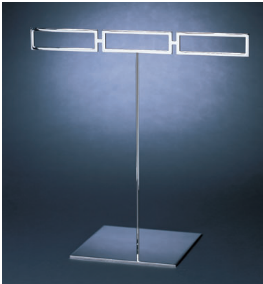
TRIPLE SCARF HOLDER S-3 T