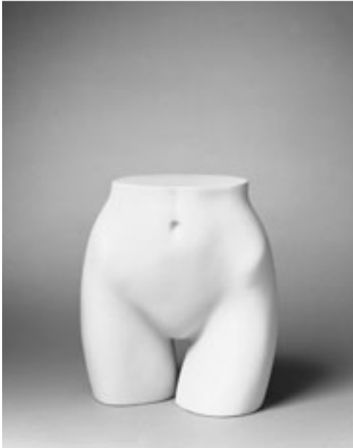
PANTY FORM LI-7