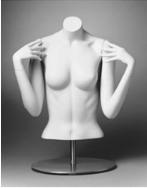
BRA FORM LI-9